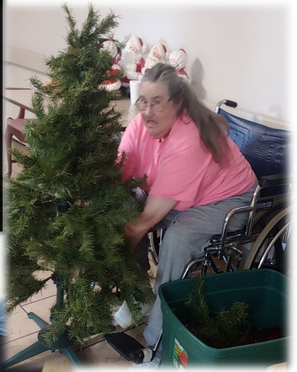
Breaking out the Christmas Decorations!!!!